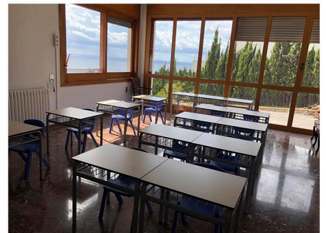
Year 1 Classroom